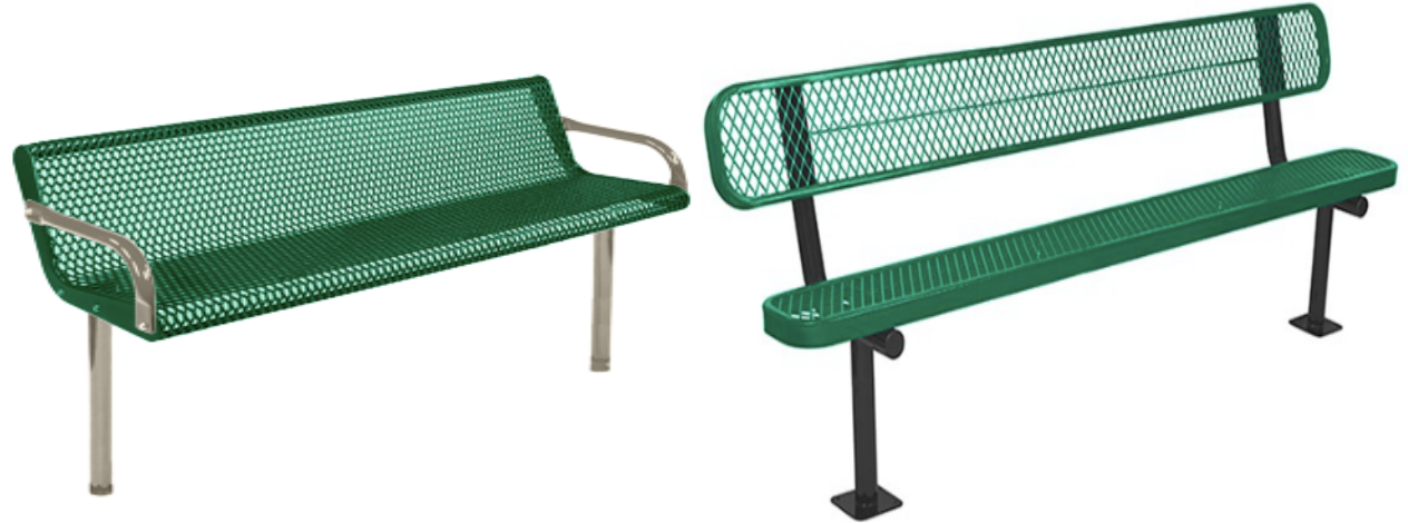
Bench with Arms

Name of park or trail you would like your bench located if possible: